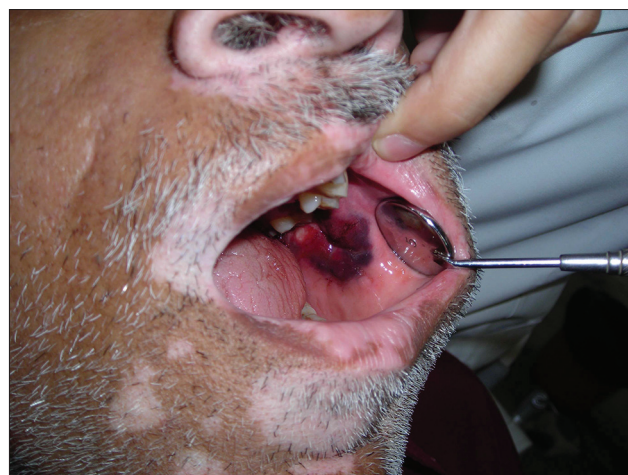
Figure 2: Intra-oral photograph reveals ecchymosis in buccal mucosa